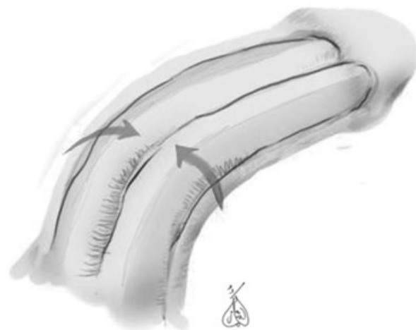
Figure 5 Direction of rotation of the corpora cavernosa.