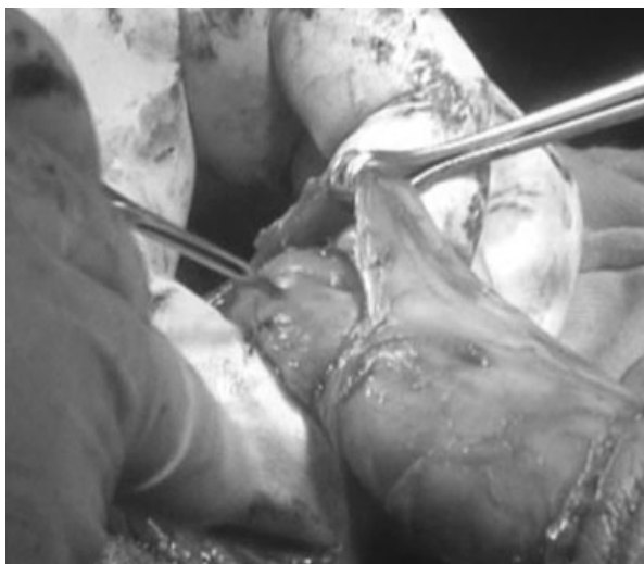
Figure 3 Incising the corpora cavernosa underneath the neurovascular bundle.