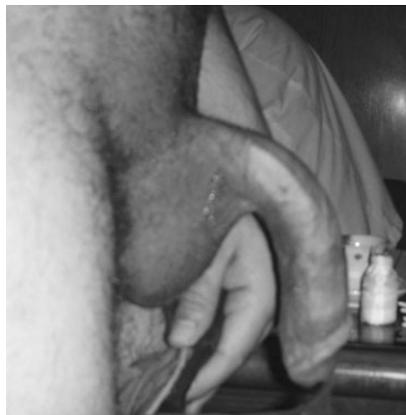
Figure 1 Preoperative erect penis showing a 90-degree ventral curve.

The procedure was performed under general anesthesia. The incision was subcoronal circumferential. The penis was de-gloved. Artificial erection was induced by saline infusion. The ventral side was inspected for tethering chordee. None was found except for a few bands of Buck's fascia that were resected, resulting in mild correction of the degree of curvature. Curvature was reassessed and the point of maximum curvature was marked.