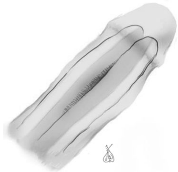
Figure 8 End result: full correction with increase in distal girth.

longer than the corresponding preoperative length.